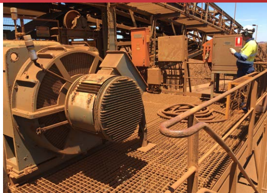
Rotor Cubicle Replacements Category: E&I Installations Type: Procure, Construct, Commission