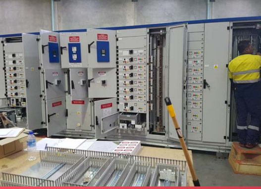
Switchboard/MCC Replacements Category: E&I Installations Type: Procure, Construct, Commission