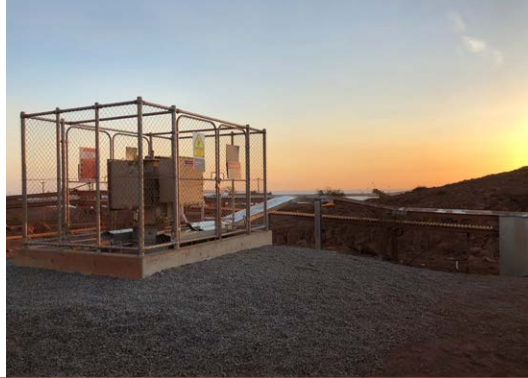
Transformer and HV Cable Replacements Category: E&I Installations Type: Procure, Construct, Commission Inc Civil & Mechanical Services