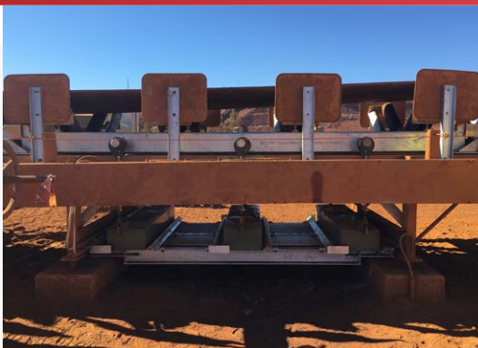
Conveyor Weigher Installations Category: E&I Installations Type: Construct, Commission Inc Mechanical Services