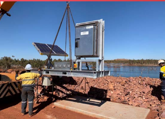
Remote Telemetry Solar Skid Fabrication & Installation Category: E&I Installations Type: Fabrication, Construct, Commission Inc Civil Services