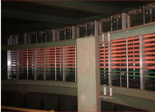
Drag Chain Installations Category: E&I Installations Type: Procure, Construct, Commission