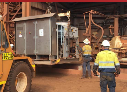
Crusher Chiller Unit Upgrades Category: E&I Installations Type: Construct, Commission Inc Mechanical Services