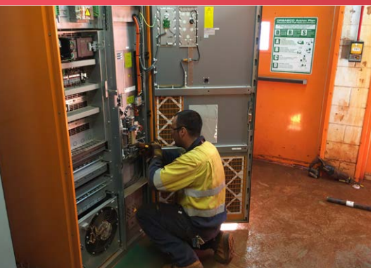
VSD / VVVF Upgrades Category: E&I Installations Type: Procure, Construct, Commission